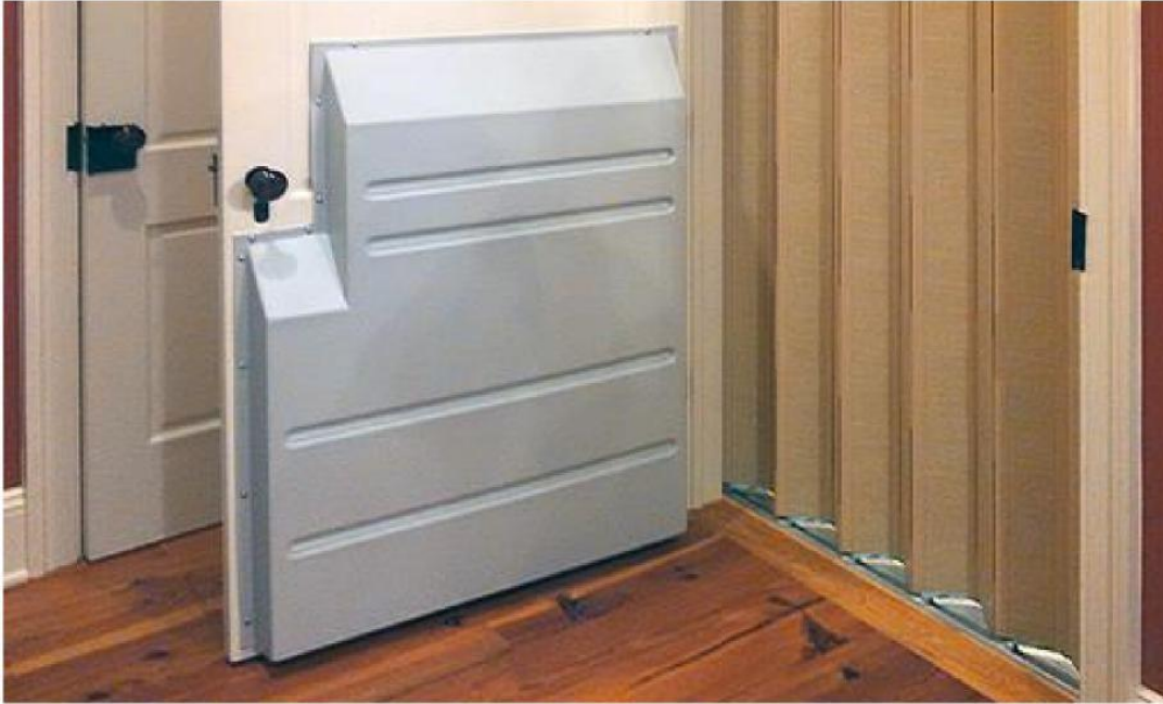
Example of an installed safety device/space guard